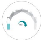
2. Mix and wait for reaction