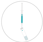
1. Inject sample